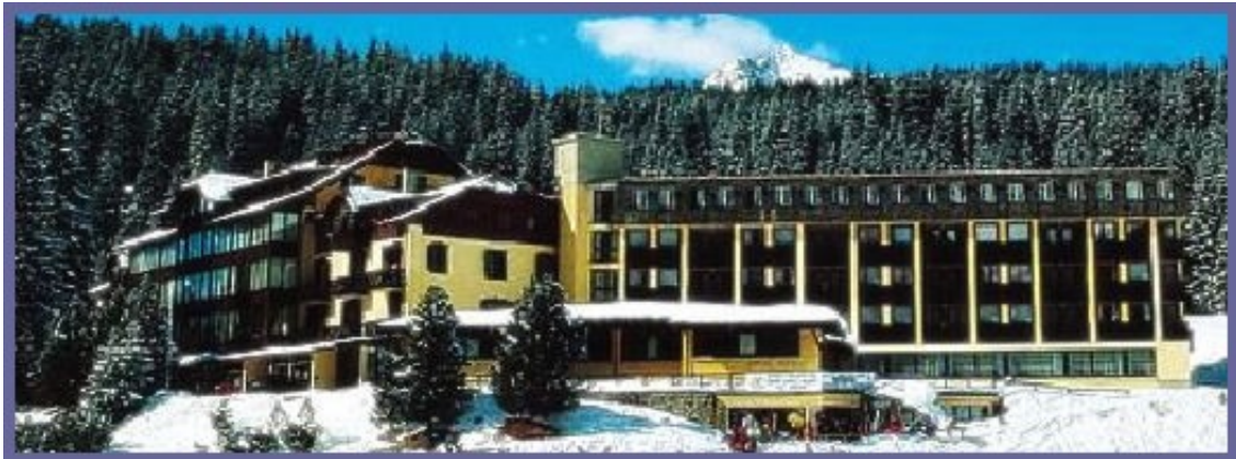
Golf Hotel**** Via Cima Tosa, 3 38086 Madonna di Campiglio (TN)

Additional fee to be paid individually by the guest directly to the Hotel.